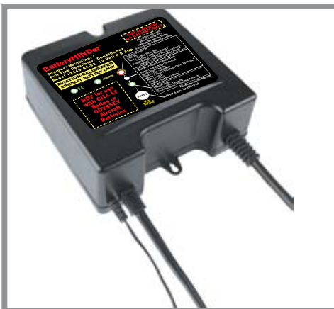
BatteryMINDER Model 12248-AA-S2* Aviation specific charger from VDC Electronics - the only way to go for AGM batteries.

The chemical actions are the same as for the wet cell battery, but improved design and internal structure as well as a positive internal pressure maintained by a valve significantly